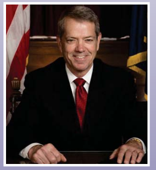
Jim Pillen Governor, State of Nebraska